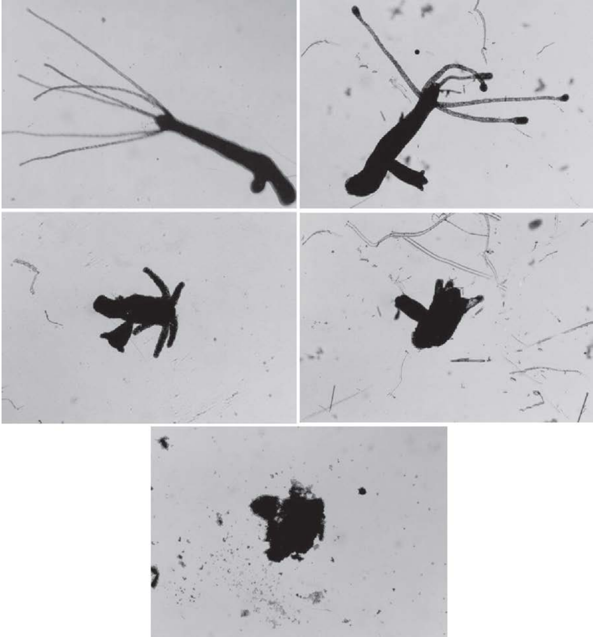
Fig. 1. Morphological stages in Hydra attenuate after exposure to REEs for 96 h (magnification x40): healthy polyp (A); clubbed tentacles (B); shortened tentacles(C); tulip stages (D) and disintegrated stage (E). Scale bar.