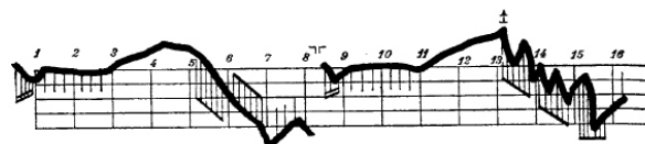
Menuetto, String Quartet in D, K. 575, mvt. III, mm. 1-16

Melodic contour has been considered by many musicologists as a means of defining relative changes in pitch (Toch, 1948) (with respect to time), rather than the definition of absolute values. In this manner, the shape, direction and range of a melody can all be summarised by its overall contour. Graphical contour representations were considered by composers such as Schoenberg (Schoenberg & Strang, 1967) as a means of supplementing a musical score (Figure 1):