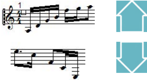
Figure 2. Example Up and Down Contour Icons, with associated musical score representations

In previous research into the use of contour (Cullen & Coyle, 2005, 2006), multimodal patterns defined as contour icons were developed to exploit gestalt concepts of good continuation and belongingness (Bregman, 1993) (Figure 2):