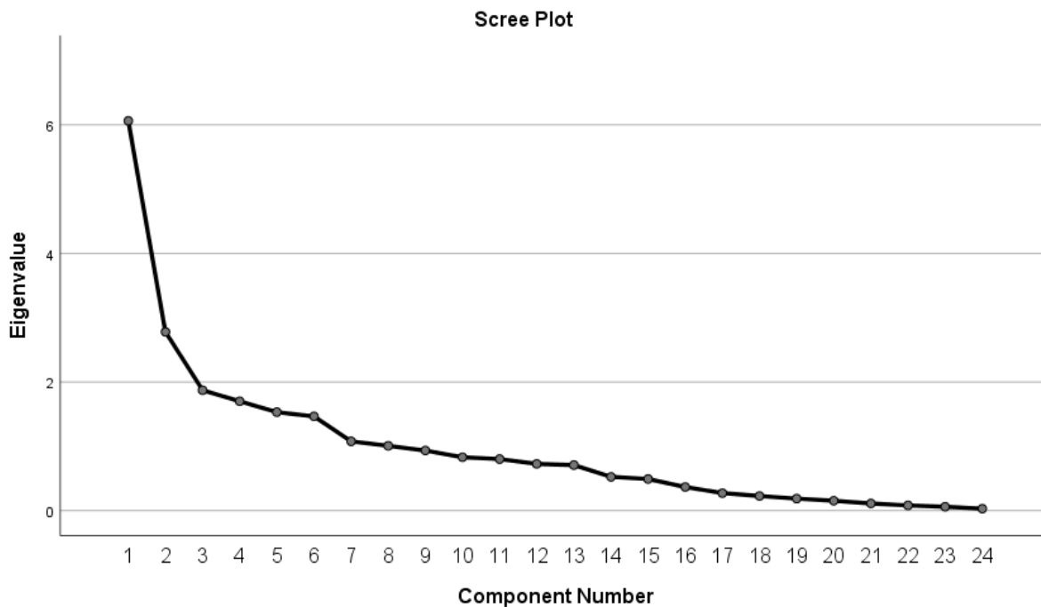
Figure 2: Scree plot

Having decided that eight factors were to be extracted these were rotated to simplify the data structure to allow for better interpretation of the variables. Unrotated factor loadings are often difficult to interpret. The aim of factor loading was to attain an optimal simple structure which tried to have each variable load on to as few factors as possible (Young and Pearce, 2013). The chosen technique was the orthogonal equamax rotation. Table 11 below shows the variable loadings on the extracted eight components after rotation. This rotated factor matrix shows the questionnaire question number associated with each factor. The study therefore proposes 8 constructs for success.