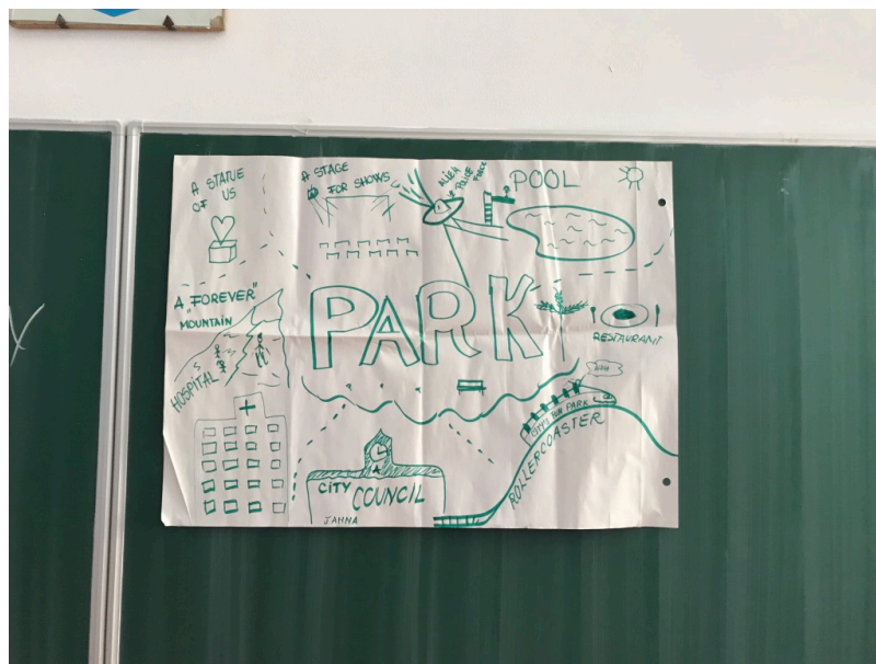
Figure 3: Drawing by workshop participants (October 2017).