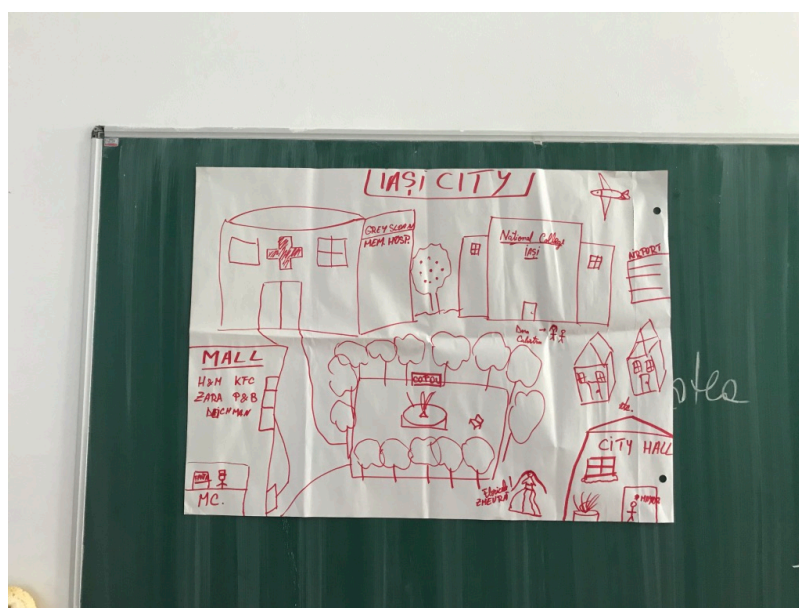
Figure 1: Drawing by workshop participants (October 2017).

I asked the students to work in small groups to produce a sketch of the new city, detailing anything they would like to see. With an unlimited imaginary budget, they set to work on putting their ideas down on paper.