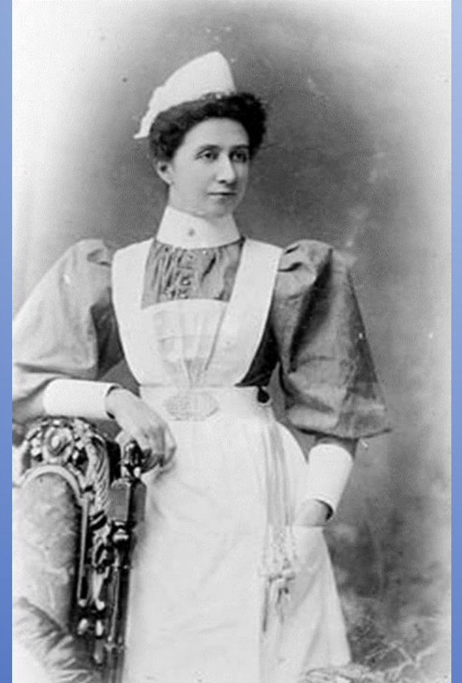
Glasgow Nurse (1890)