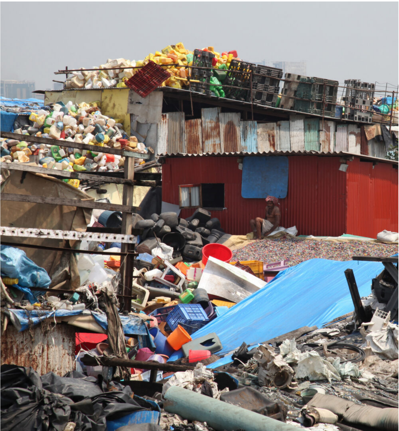
Roofs tops of 13 Compounds, Dharavi Mumbai, 2019

'We have to follow the things themselves, for their meanings are inscribed in their forms, their uses, their trajectories' (Appadurai, 1986, p.5).